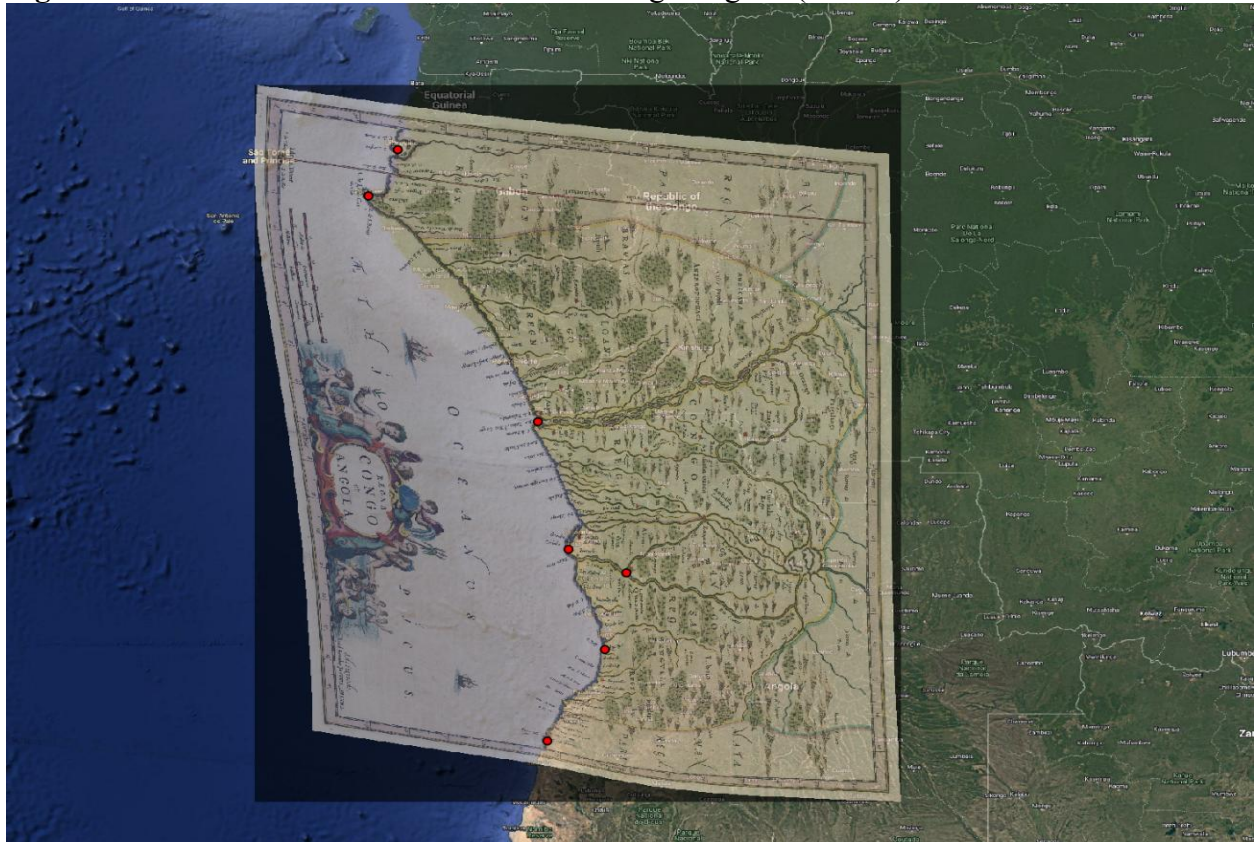
Figure II GEO-REFERENCED “Dongo Regn.” (rotated)